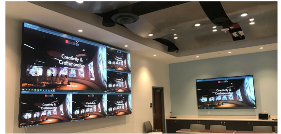
Mist Lake Facility

The City of Durham's new water-themed Mist Lake Facility provides training and administrative space for the Water Management division, including a four-way divisible training space - the largest in the city system - with extensive AV capabilities.