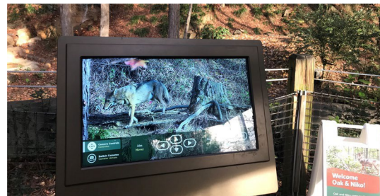
Museum of Life + Science

Lemurs, wolves & bears! Durham's cherished Museum of Life + Science has entertained and educated young visitors since 1946. Its latest expansion includes a robotic camera system so kids can zoom in on the animals, plus a total lobby makeover featuring a video wall created with six displays in portrait orientation.